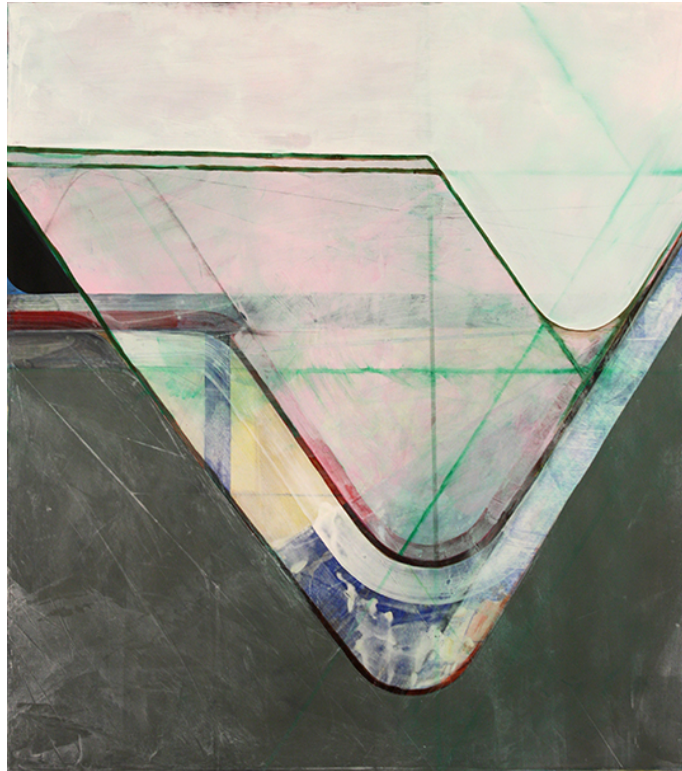
Cross-section, 2017, acrylic on paper, 50 x 45 inches

Reception for the artist: Thursday, March 8, 6-8 PM